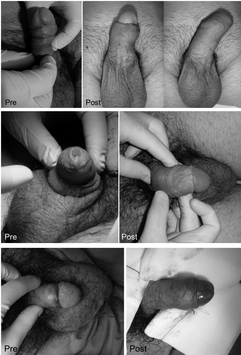
Fig. 2 A-B – Pre- (A) and post- (B) operative.

quently, the prepuce-plasty was reported as variation of Z-plasty, multiple Y-V-plasties, lateral preuceplasty, multiple internal foreskin lamina and triple incision plasty (12-16). We report an easy technique based on the incomplete postectomy with continuous sutures. Its rationale is based on the removal of the phimosis ring using oblique lines of incision, which increases the diameter